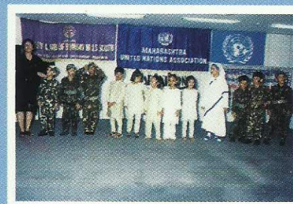
U.N. Day Cultural Program held on 24 Oct. 1999. School children from Indonesian School and Royal Education Society.