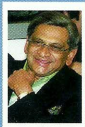
S. M. KRISHNA