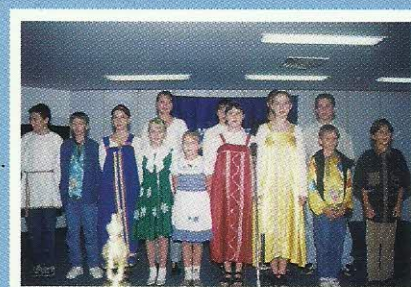
U.N. Day Cultural Program held on 24.10.2000. U.S.A. School children in group.