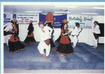
U.N. Day Cultural Program held on 24 Oct. 1998 Indian Rural Folk Dance.